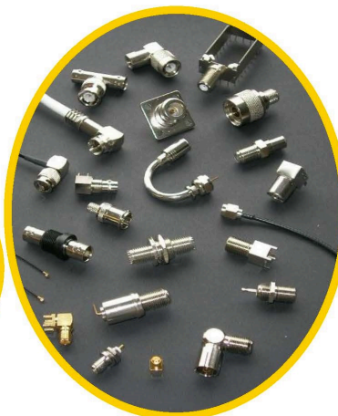
RF connectors, U-links and adaptors