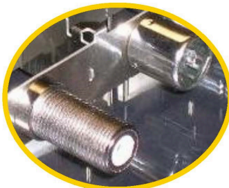
RF shielding with or without connectors